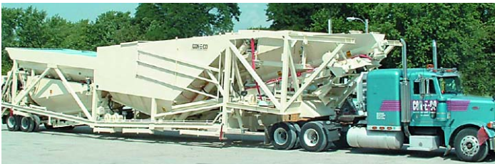
Mobile tow-away self-erecting batch plant.

7.5 horsepower with 80 gallon (0.30 cubic meters) receiver. Optional 10, 15, 20 or 30 horsepower, 120 gallon (0.45 cubic meters)